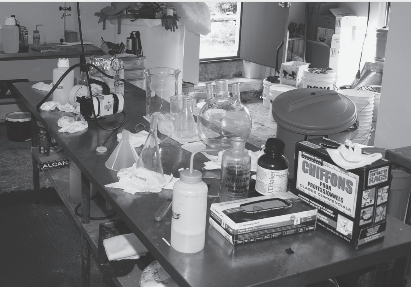
In 2009, the Sûreté du Québec discovered a clandestine laboratory used for the production of both methamphetamine and ecstasy. Several of these hybrid labs have been discovered in Quebec since 2000.

In short, regardless of the accuracy of our estimates and the choice of scenarios we propose, one fact remains: there seems to be a supply/demand imbalance in Québec for the two types of substances that were the focus of this research. It remains to be seen what impact this imbalance will have on more prevalent use of these drugs among Quebecers.