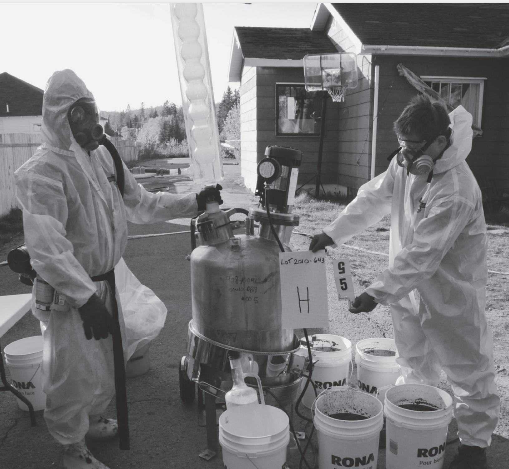
In 2010, the Sûreté du Québec dismantled an important methamphetamine laboratory. The picture shows a large reactor which was used in the process of drug synthesis.